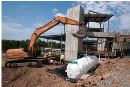
This 1,700-gallon underground cistern stores runoff water from the CSL roof for reuse as flush water.