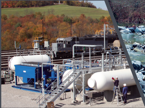
1: This large rail-loading facility fills 24 tanker cars at a time, moving purified products to market.

Greater flexibility to respond to immediate client needs means CEC can help implement a targeted solution faster. For spills and releases, CEC characterizes and assesses impacts and also develops and implements efficient and effective remediation plans and activities.