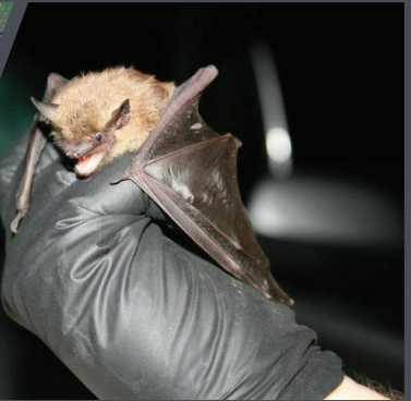
3: State- and federally certified surveyors conduct habitat assessments and offer mitigation alternatives for threatened and endangered bat species.