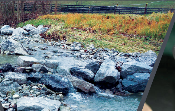
2: This constructed rock riffle structure within a stream channel is part of a natural gas pipeline exposure repair project in Kentucky.