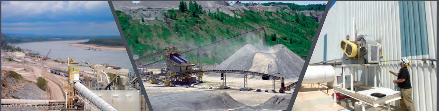
1: Evaluating air permit compliance requirements at a lime plant in Ste. Genevieve , MO.

CEC evaluates the possible effects of mining on streams and wetlands and designs plans to mitigate impacts. Biological monitoring services can be implemented to develop cost-effective variances to permit requirements, reducing facility operation or construction costs.